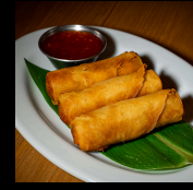
VEGETABLE SPRING ROLL (2 PC)