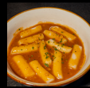
RICE CAKE (5 PC)