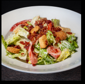
HOUSE GARDEN SALAD (SMALL)