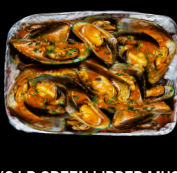
1/2 LB GREEN LIPPED MUSSEL