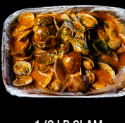
1/2 LB CLAM