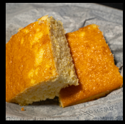
SOUTHERN CORN BREAD (1 PC)