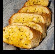
GARLIC BUTTER BREAD (3 PC)