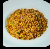
CRAB MEAT FRIED RICE (SMALL)