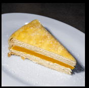
MANGO CREPE CAKE