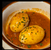
EGG (1 PC)