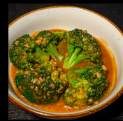
BROCCOLI (3 PC)