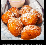
FRIED DONUTS (4 PC)

Add your favorite sides for seafood boil