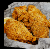
LEMON PEPPER WINGS (2 PC)