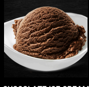
CHOCOLATE ICE CREAM