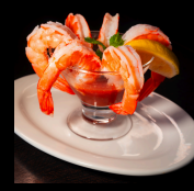
SHRIMP COCKTAIL (4 PC)