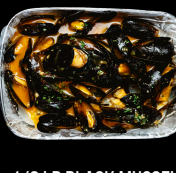
1/2 LB BLACK MUSSEL