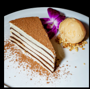
NUTELLA CREPE CAKE