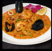
SHRIMP COCONUT CURRY RICE (SMALL)