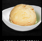
VANILLA ICE CREAM