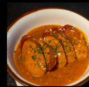
SAUSAGE (3 PC)