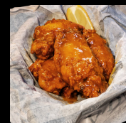
HONEY GARLIC WINGS (2 PC)