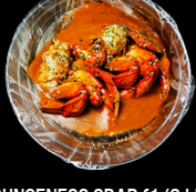
DUNGENESS CRAB (1/2 LB)