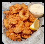
FRIED CALAMARI (8 PC)