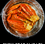
SNOW CRAB (1/2 LB)