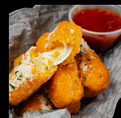
MOZZARELLA STICKS (2 PC)

(0-4 YEARS OLD) FREE (5-10 YEARS OLD) $19.99