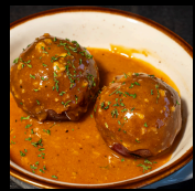
POTATO (1 PC)