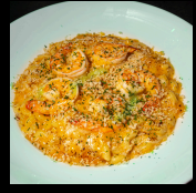
SHRIMP MAC AND CHEESE (SMALL)