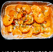
1/2 LB SHRIMP HEAD OFF