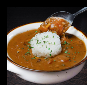
SEAFOOD GUMBO SOUP