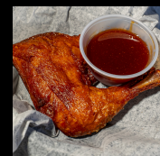
ASIAN BBQ CHICKEN