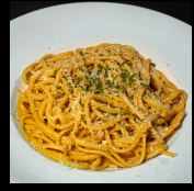
GARLIC BUTTER NOODLE (SMALL)