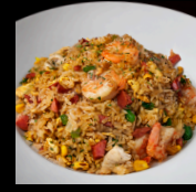
SHRIMP CAJUN FRIED RICE (SMALL)