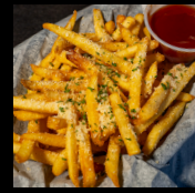
GARLIC PARMESAN FRIES