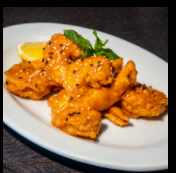
SRIRACHA MAYO SHRIMP (4 PC)