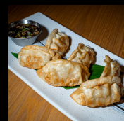
FRIED PORK GYOZA (3 PC)