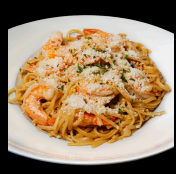
SHRIMP GARLIC NOODLE (SMALL)