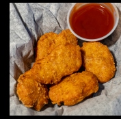
CHICKEN NUGGETS (5PC)