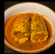
CORN (1 PC)