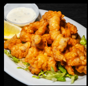
ALLIGATOR BITES (4 PC)