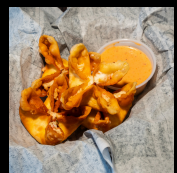
CRAB CHEESE ROLL (2 PC)