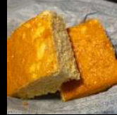
SOUTHERN CORN BREAD (1 PC)