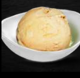
VANILLA ICE CREAM