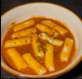
RICE CAKE (5 PC)