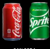
CAN SODA (Coke/ Sprite/ Fanta)