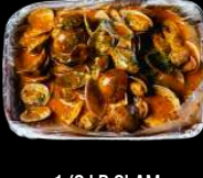
1/2 LB CLAM