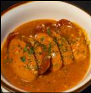
SAUSAGE (3 PC)