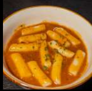
RICE CAKE (5 PC)