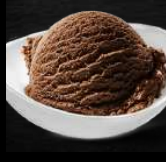
CHOCOLATE ICE CREAM