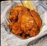
HONEY GARLIC WINGS (2 PC)