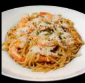
SHRIMP GARLIC NOODLE (SMALL)