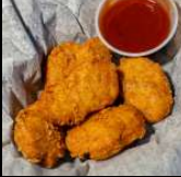
CHICKEN NUGGETS (5 PC)