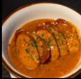
SAUSAGE (3 PC)