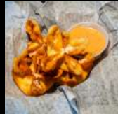
CRAB CHEESE ROLL (2 PC)