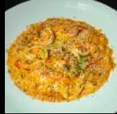
SHRIMP MAC AND CHEESE (SMALL)