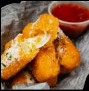
MOZZARELLA STICKS (2 PC)