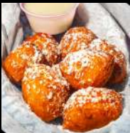
FRIED DONUTS (4 PC)