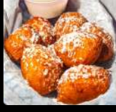
FRIED DONUTS (4 PC)