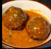
POTATO (1 PC)