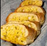
GARLIC BUTTER BREAD (3 PC)