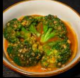
BROCCOLI (3 PC)