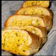
GARLIC BUTTER BREAD (3 PC)