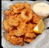
FRIED CALAMARI (8 PC)