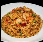
SHRIMP CAJUN FRIED RICE (SMALL)