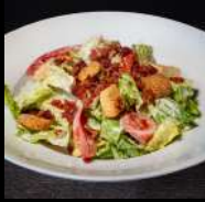
HOUSE GARDEN SALAD (SMALL)