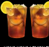
HONG KONG LEMON TEA ( Must-try, house-made- - perfect with spicy seafood)