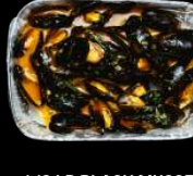
1/2 LB BLACK MUSSEL