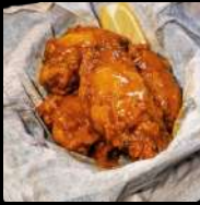
HONEY GARLIC WINGS (2 PC)