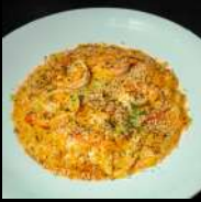
SHRIMP MAC AND CHEESE (SMALL)