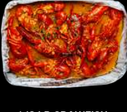
1/2 LB CRAWFISH