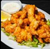
ALLIGATOR BITES (4 PC)