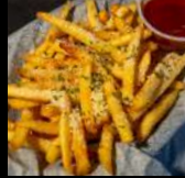
GARLIC PARMESAN FRIESS