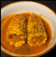
CORN (1 PC)