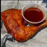
HOUSE ROASTED BBQ CHICKEN