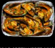
1/2 LB GREEN LIPPED MUSSEL