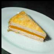
MANGO CREPE CAKE