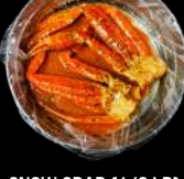
SNOW CRAB (1/2 LB)