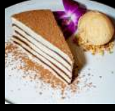
NUTELLA CREPE CAKE