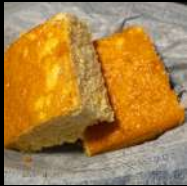
SOUTHERN CORN BREAD (1 PC)