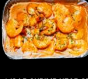
1/2 LB SHRIMP HEAD OFF