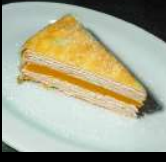
MANGO CREPE CAKE