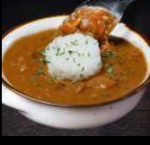
SEAFOOD GUMBO SOUP