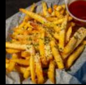
GARLIC PARMESAN FRIESS