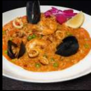
SHRIMP COCONUT CURRY RICE (SMALL)