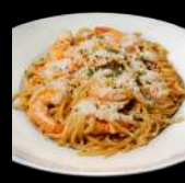
SHRIMP GARLIC NOODLE (SMALL)