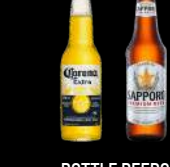
BOTTLE BEERS (Blue Moon/ Lucky Buddha / Sapporo/ Corona/ Stella)