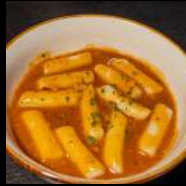
RICE CAKE (5 PC)