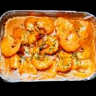
1/2 LB SHRIMP HEAD OFF