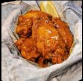
HONEY GARLIC WINGS (2 PC)