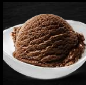
CHOCOLATE ICE CREAM