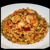
SHRIMP CAJUN FRIED RICE (SMALL)