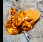
CRAB CHEESE ROLL (2 PC)