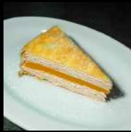
MANGO CREPE CAKE