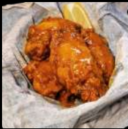
HONEY GARLIC WINGS (2 PC)