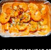
1/2 LB SHRIMP HEAD OFF