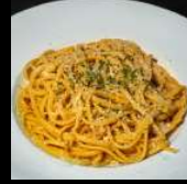
GARLIC BUTTER NOODLE (SMALL)