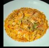
SHRIMP MAC AND CHEESE (SMALL)