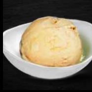
VANILLA ICE CREAM