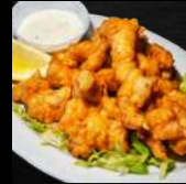
ALLIGATOR BITES (4 PC)