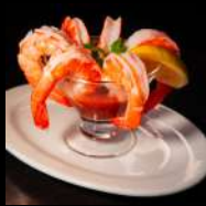
SHRIMP COCKTAIL (4 PC)