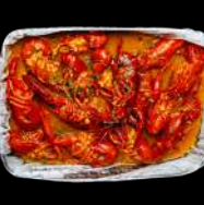
1/2 LB CRAWFISH