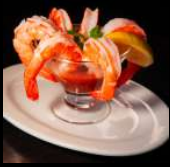
SHRIMP COCKTAIL (4 PC)