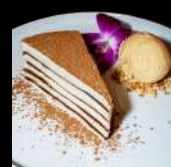
NUTELLA CREPE CAKE