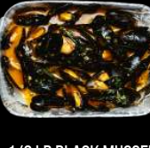
1/2 LB BLACK MUSSEL