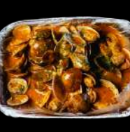
1/2 LB CLAM