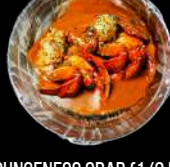
DUNGENESS CRAB (1/2 LB)