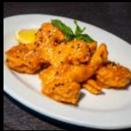
SRIRACHA MAYO SHRIMP (3 PC)