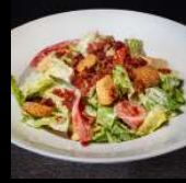
HOUSE GARDEN SALAD (SMALL)