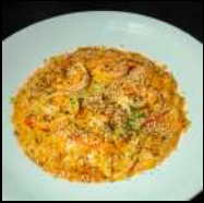
SHRIMP MAC AND CHEESE (SMALL)