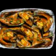
1/2 LB GREEN LIPPED MUSSEL