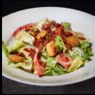
HOUSE GARDEN SALAD (SMALL)