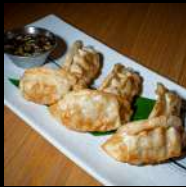
FRIED PORK GYOZA (2 PC)