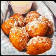
FRIED DONUTS (4 PC)