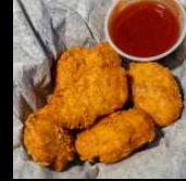
CHICKEN NUGGETS (5PC)