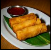
VEGETABLE SPRING ROLL (2 PC)