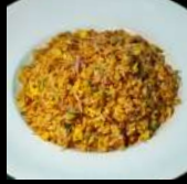
CRAB MEAT FRIED RICE (SMALL)