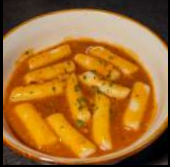
RICE CAKE (5 PC)