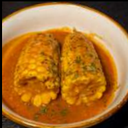
CORN (1 PC)