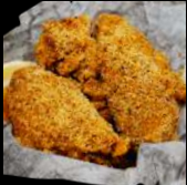
LEMON PEPPER WINGS (2 PC)