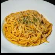
GARLIC BUTTER NOODLE (SMALL)