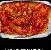
1/2 LB CRAWFISH