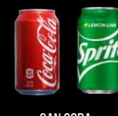
CAN SODA (Coke/ Sprite/ Fanta)