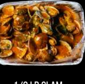
1/2 LB CLAM