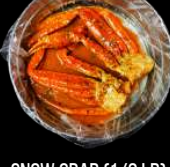
SNOW CRAB (1/2 LB)