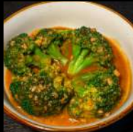
BROCCOLI (3 PC)