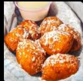
FRIED DONUTS (4 PC)