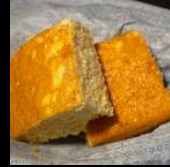
SOUTHERN CORN BREAD (1 PC)