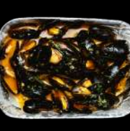
1/2 LB BLACK MUSSEL