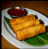
VEGETABLE SPRING ROLL (2 PC)