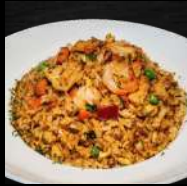
SHRIMP CAJUN FRIED RICE (SMALL)