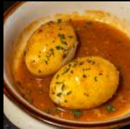
EGG (1 PC)