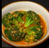
BROCCOLI (3 PC)