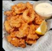
FRIED CALAMARI (8 PC)