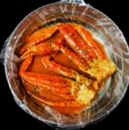
SNOW CRAB (1/2 LB)