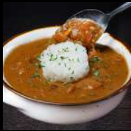
SEAFOOD GUMBO SOUP