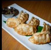
FRIED PORK GYOZA (2 PC)