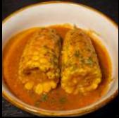
CORN (1 PC)