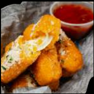
MOZZARELLA STICKS (2 PC)