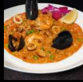
SHRIMP COCONUT CURRY RICE (SMALL)