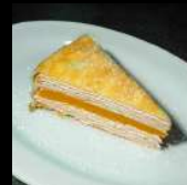
MANGO CREPE CAKE