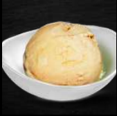
VANILLA ICE CREAM