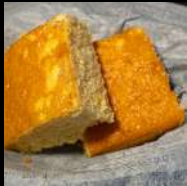
SOUTHERN CORN BREAD (1 PC)