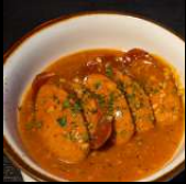
SAUSAGE (3 PC)