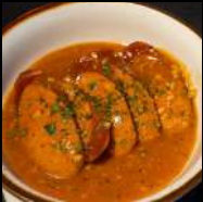
SAUSAGE (3 PC)