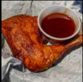
HOUSE ROASTED BBQ CHICKEN