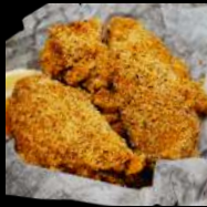
LEMON PEPPER WINGS (2 PC)