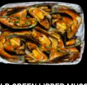
1/2 LB GREEN LIPPED MUSSEL