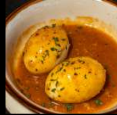
EGG (1 PC)