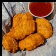
CHICKEN NUGGETS (5 PC)