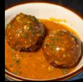
POTATO (1 PC)