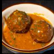
POTATO (1 PC)