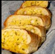
GARLIC BUTTER BREAD (3 PC)