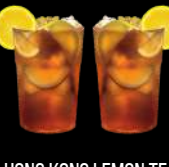
HONG KONG LEMON TEA ( Must-try, house-made- - perfect with spicy seafood)