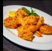
SRIRACHA MAYO SHRIMP (3 PC)