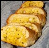
GARLIC BUTTER BREAD (3 PC)