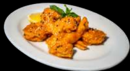
SRIRACHA MAYO SHRIMP (3 PC)