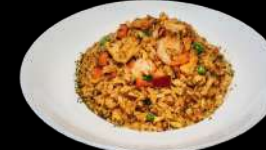
SHRIMP CAJUN FRIED RICE