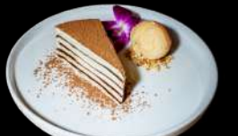
NUTELLA CREPE CAKE