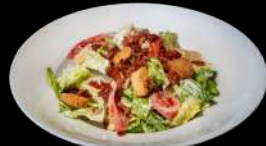
HOUSE GARDEN SALAD