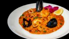
SHRIMP COCONUT CURRY RICE