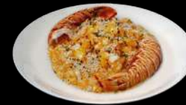
SHRIMP MAC AND CHEESE