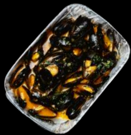
1/2 LB BLACK MUSSEL