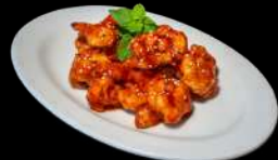
ASIAN ZEST CAULIFLOWER (4 PC)