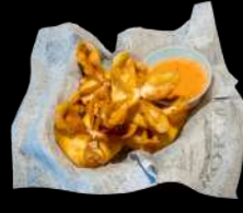
CRAB CHEESE ROLL (2 PC)