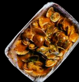
1/2 LB CLAM