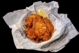
HONEY GARLIC WINGS (2 PC)