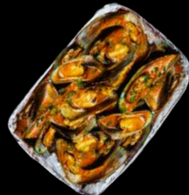
1/2 LB GREEN LIPPED MUSSEL