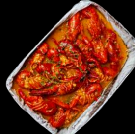
1/2 LB CRAWFISH