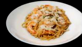
CHICKEN GARLIC NOODLE