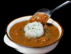
SEAFOOD GUMBO SOUP