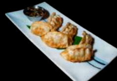
FRIED PORK GYOZA (2 PC)