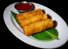
VEGETABLE SPRING ROLL (2 PC)