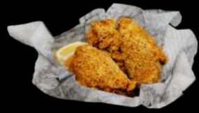
LEMON PEPPER WINGS (2 PC)