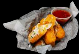
MOZZARELLA STICKS (2 PC)