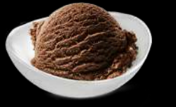
CHOCOLATE OR VANILLA ICE CREAM