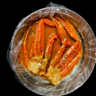
1/2 LB SNOW CRAB