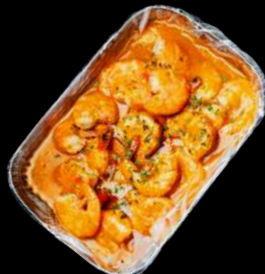
1/2 LB SHRIMP HEAD OFF