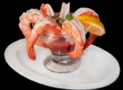
SHRIMP COCKTAIL (4 PC)