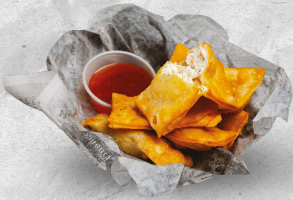
HOMEMADE CRAB CHEESE ROLL