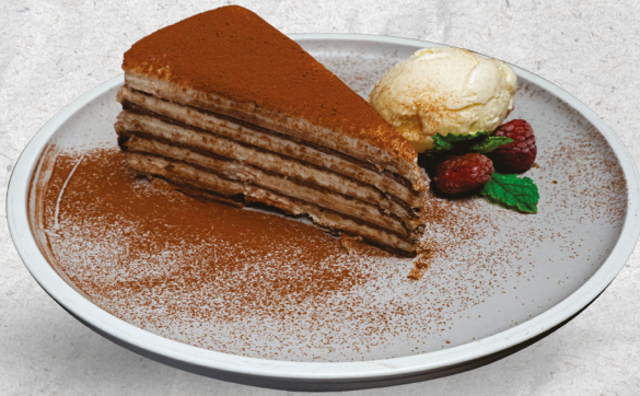
NUTELLA CREPE CAKE