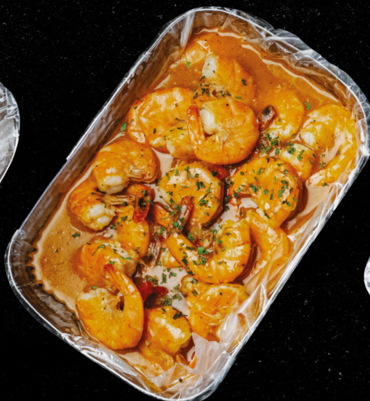
JUMBO SHRIMP HEAD ON 1/2 LB 1LB