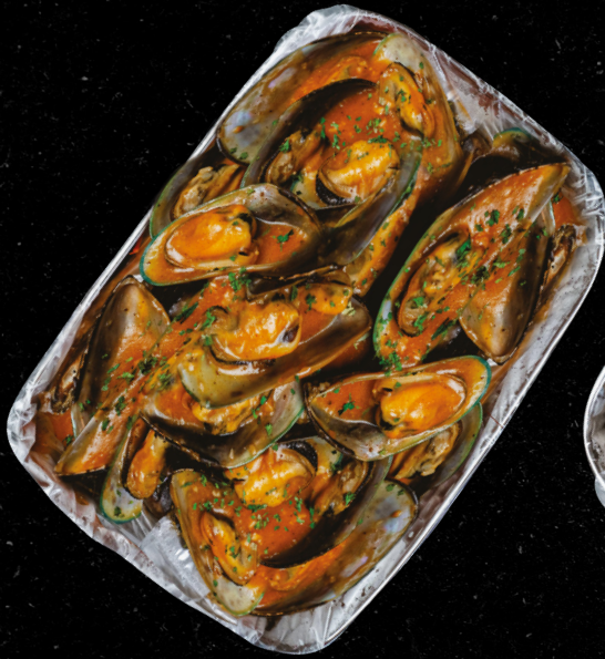
GREEN-LIPPED MUSSEL 1LB