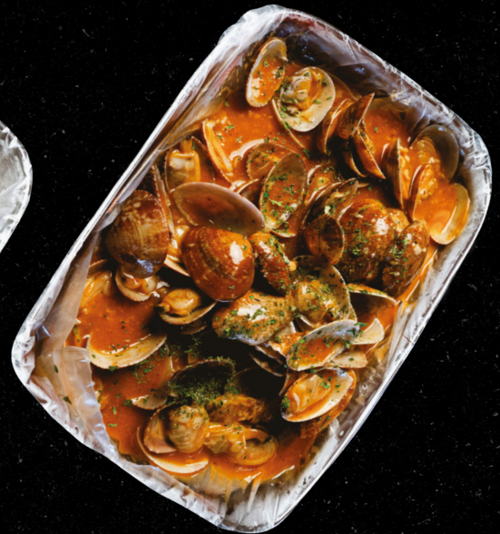
MIDDLENECK CLAM 1LB