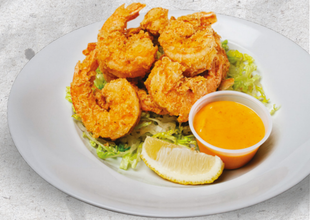
CRISPY JUMBO SHRIMP