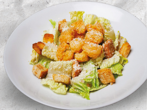
CAESAR SALAD ADD BOILED EGG ADD FRIED SHRIMP