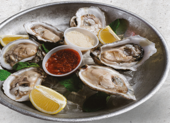
FRESH OYSTERS HALF DOZEN / DOZEN