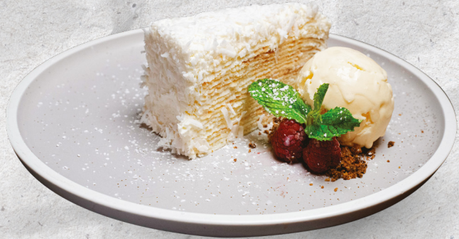
COCONUT CREPE CAKE