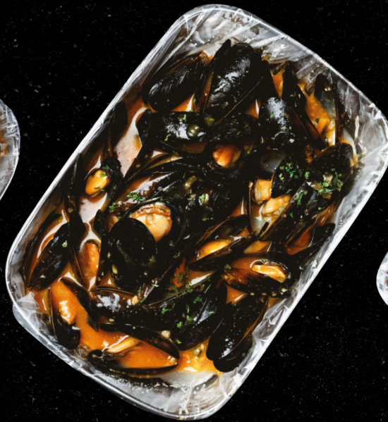
BLACK MUSSEL 1LB