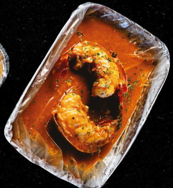
LOBSTER TAIL 1 TAIL 2 TAILS