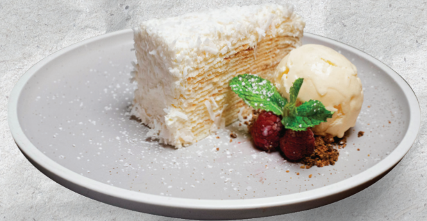
COCONUT CREPE CAKE 12.00