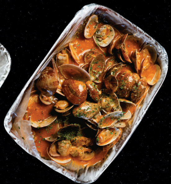
MIDDLENECK CLAM 1LB 14.99