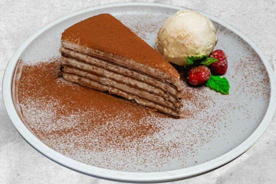
NUTELLA CREPE CAKE 12.00