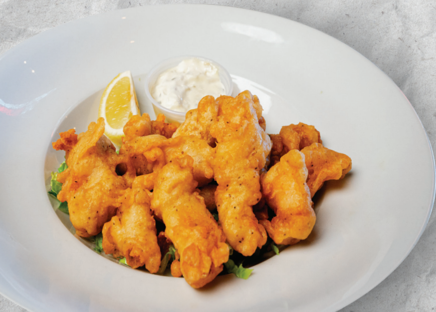
ALLIGATOR BITES 15.50

18% Gratuity will be added on group of 4 or more. Please check the bill carefully.