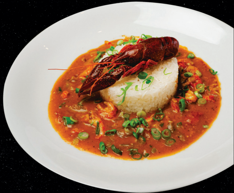
CRAWFISH ETOUFFEE 19.00

A hearty and flavorful dish that combines the classic flavors of fried rice with the bold taste of Cajun cuisine.