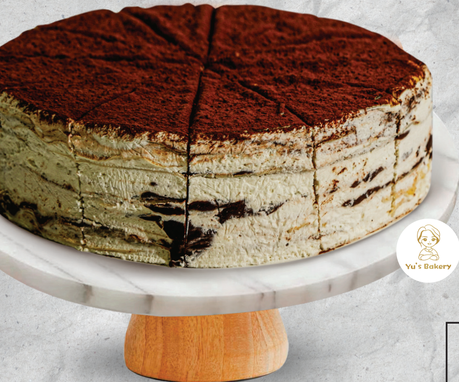
9 INCH CAKE 98.00

Bring home the unique flavors of Strawberry Basque Cheesecake, Nutella Crepe Cake or Coconut Crepe Cake. (Pre-order three days in advance)