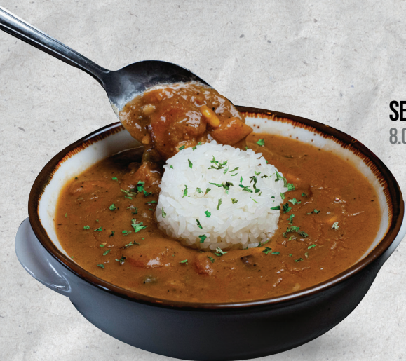
SEAFOOD GUMBO 8.00