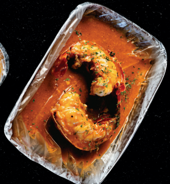
LOBSTER TAIL 1 TAIL 21.00 2 TAILS 39.99