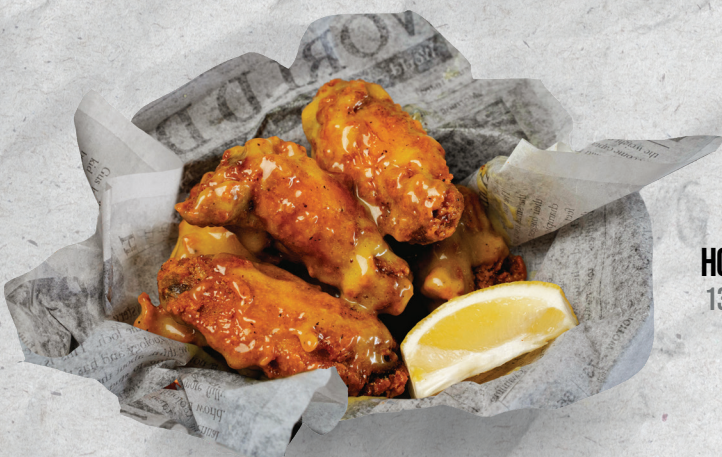
HONEY MUSTARD WINGS 13.50