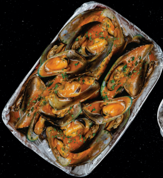
GREEN-LIPPED MUSSEL 1LB 17.99