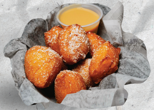
FRIED DONUTS 7.50