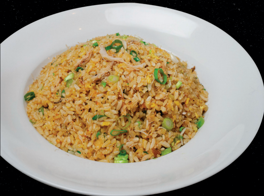
CRAB MEAT FRIED RICE 18.00

A classic Creole dish featuring tender crawfish tail meat simmered in a rich, mildly spicy sauce, served over a bed of steamed rice.