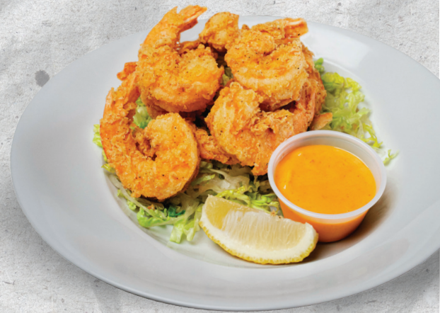
CRISPY JUMBO SHRIMP 13.50