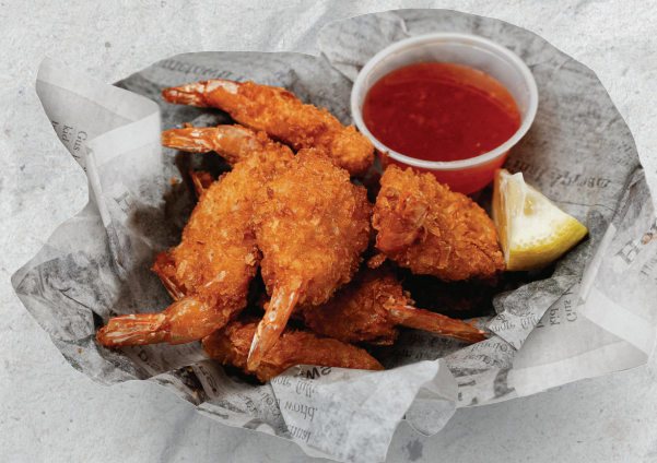
COCONUT SHRIMP 12.50