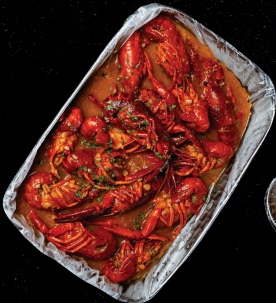
CRAWFISH 1LB 16.99