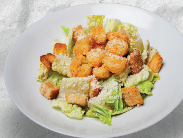
CAESAR SALAD 8.00 ADD BOILED EGG 1.50 ADD FRIED SHRIMP 4.00