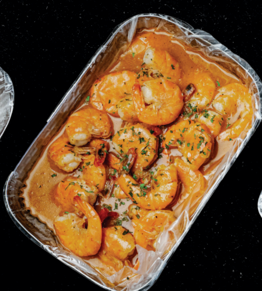
JUMBO SHRIMP HEAD ON 1/2 LB 10.00 1LB 17.99