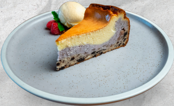
TARO BASQUE CHEESECAKE 12.00