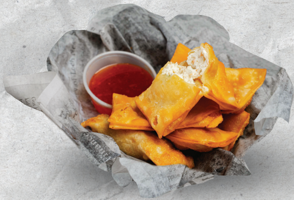
HOMEMADE CRAB CHEESE ROLL 11.00