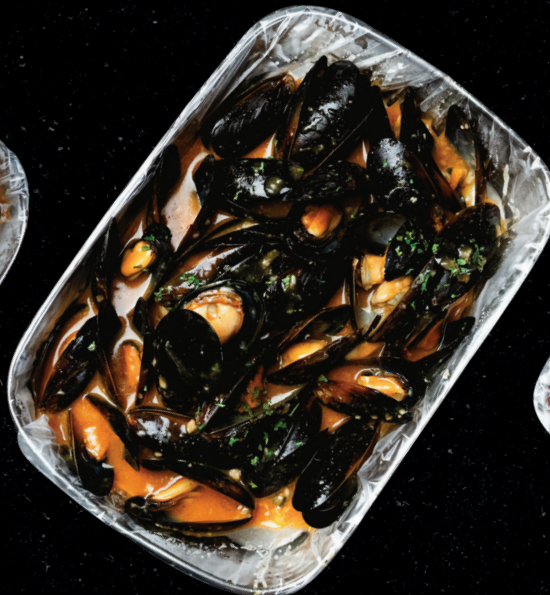
BLACK MUSSEL 1LB 14.99